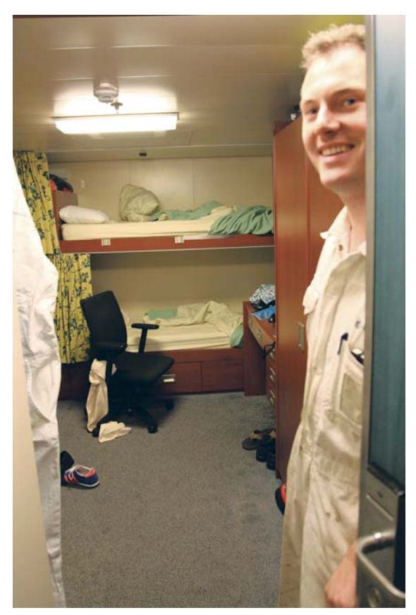
A recent research project found that 14% of seafarers were in shared cabins

3. Unless expressly provided otherwise, any requirement under an amendment to the Code relating to the provision of seafarer accommodation and recreational facilities shall apply only to ships constructed on or after the amendment takes effect for the Member concerned.