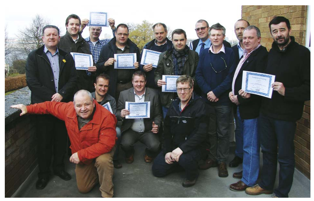
Nautilus members pictured after completing one of the MLC training courses run by the Union